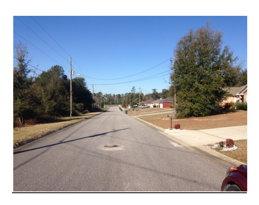
Street View – West