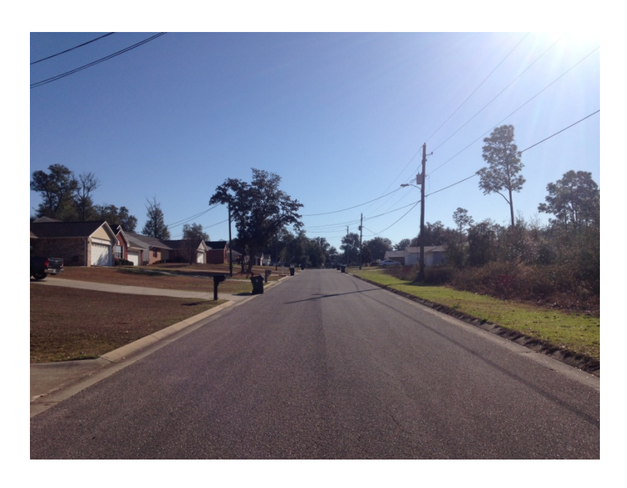
Street View - East